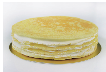
Mango Mille Crepe 芒果千層蛋糕 $250.00