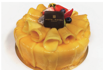
Mango Mousse Cake 芒果慕斯蛋糕 $260.00