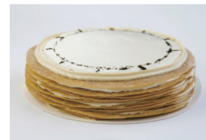
Earl Grey Mille Crepe 伯爵茶千層蛋糕 $250.00