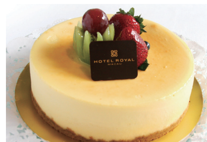
New York Cheese Cake 紐約芝士蛋糕 $260.00