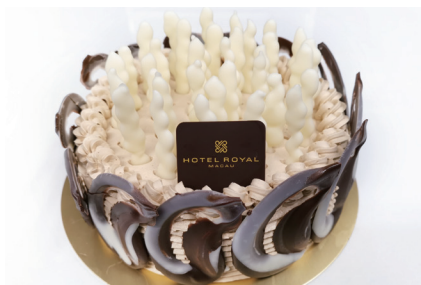
Mocha Cake 摩卡蛋糕 $220.00