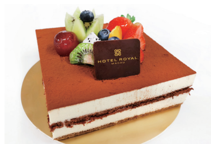
Tiramisu 意大利芝士餅 $260.00