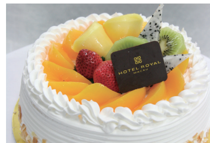
Fresh Fruit Cake 鮮果蛋糕 $230.00