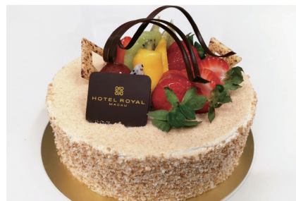
Portuguese Cream Pudding Cake 木糠慕斯蛋糕 $220.00