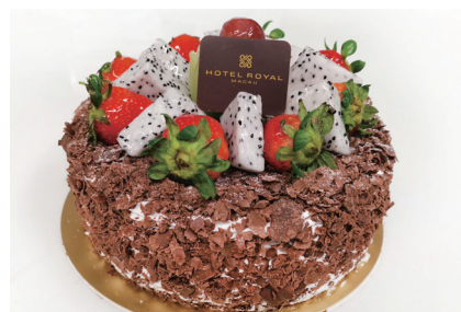
Black Forest Cake 黑森林蛋糕 $230.00