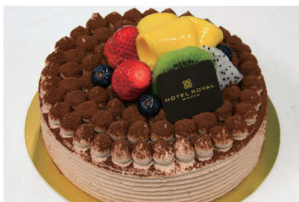
Chestnut Cake 栗蓉蛋糕 $230.00