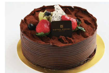
Chocolate Marquise Cake 朱古力蛋糕 $230.00